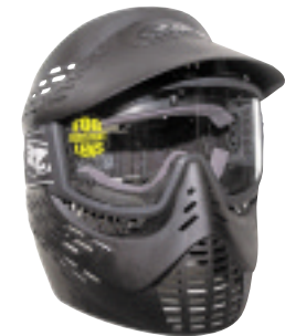
Always wear Paintball Approved Goggles

5. Only play at commercial playing fields that have a chronograph, referees and clearly marked safe fields. Chronograph your marker before each game to ensure your gun is operating at safe velocities. Safe velocities are considered to be below 280 feet per second.