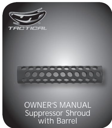
OWNER'S MANUAL Suppressor Shroud with Barrel