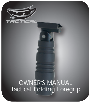
OWNER'S MANUAL Tactical Folding Foregrip